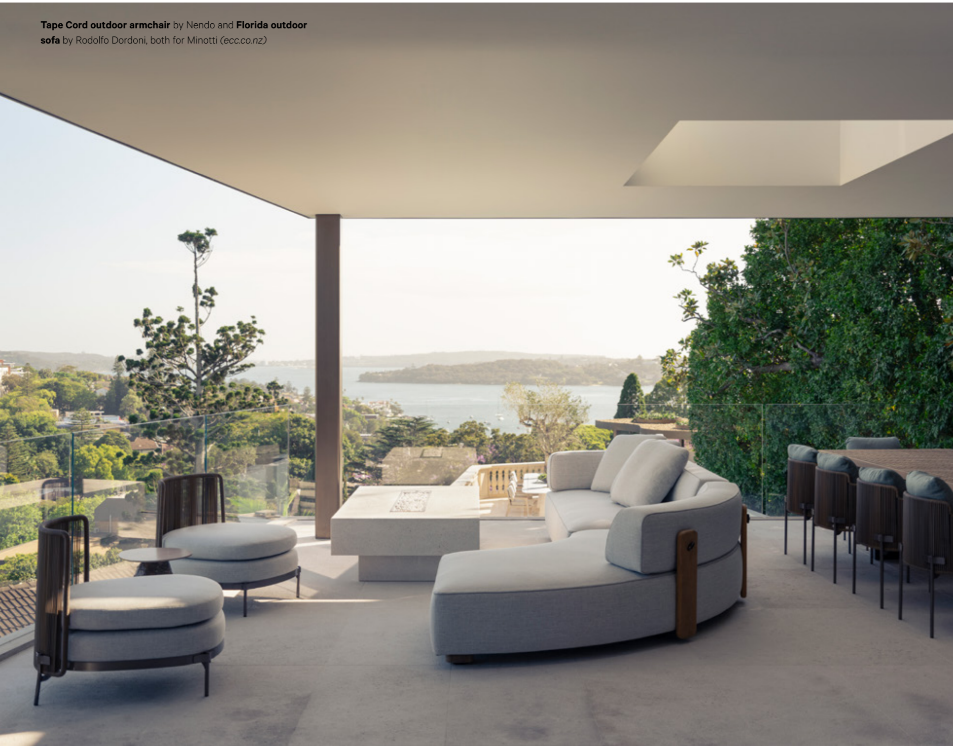
Tape Cord outdoor armchair by Nendo and Florida outdoor sofa by Rodolfo Dordoni, both for Minotti